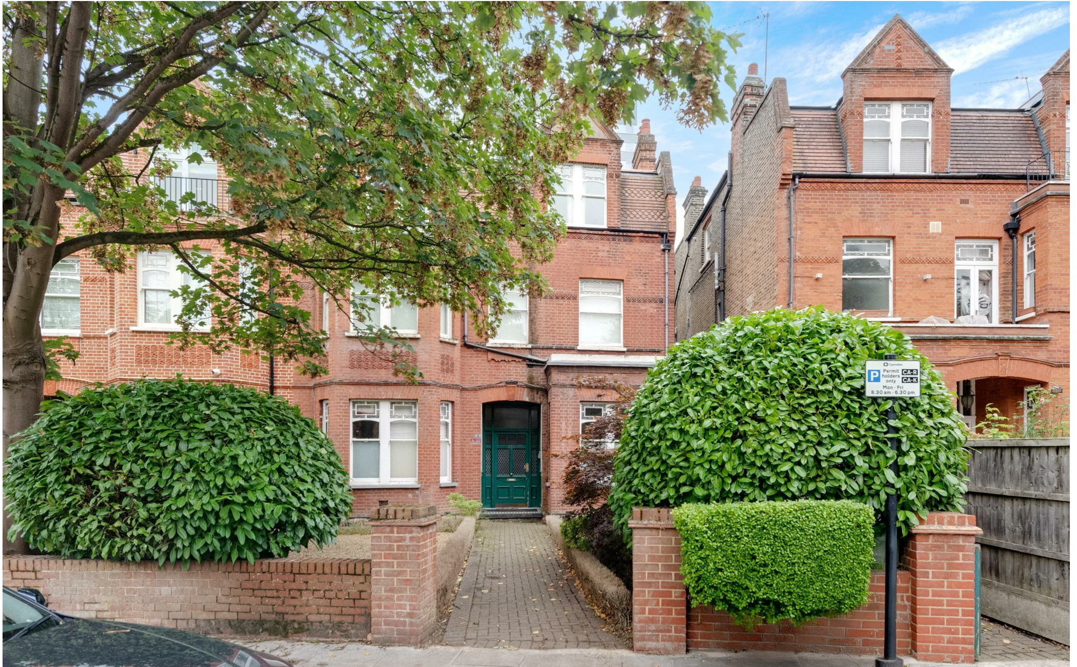
Goldhurst Terrace NW6